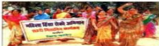
महिला हिंसा के खिलाफ जागरुक करती महिलाएँ।

सुबहार सुबह प्यारह बजे प्रहारी मिलानि कार्यक्रम के लहत मिलानिनी के द्वारा अखनगर बार्ड से जागरुकता रैली का आयोजन किया गया। रैली के माध्यम से लोनों में महिलाओं के प्रति कर रही हिंसा की रोकथाम के लिए लोनों में जागरुकता लाने का प्रयास किया गया। जिसमें मिलानिनी व बड़ी संख्या में बार्ड की महिलाओं भी शामिल हुई। जागरुकता रैली में नगरपालिका के निर्य लोनों की जागरुक करने का प्रयास भी किया गया। साथ ही नारी के